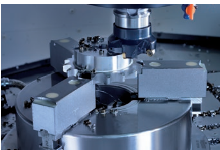
CNC lathe machining